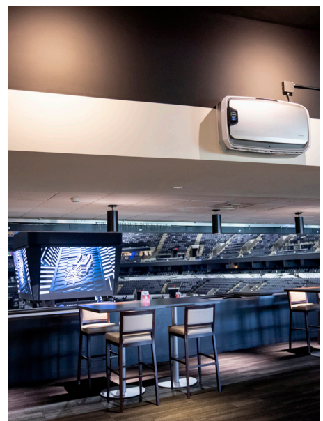
Shared Spaces AeraMax Pro units were installed include: Conference Rooms, Luxury Suites, Locker/Restrooms